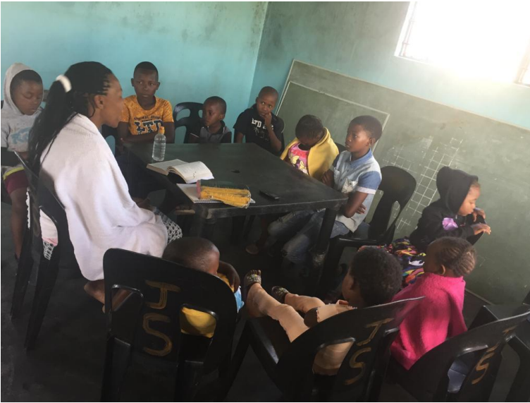
Discovery Bible Study with some of the children in the community.