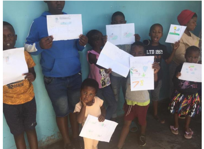
The children drawings on how they will obey what they have learned during their Bible Study.