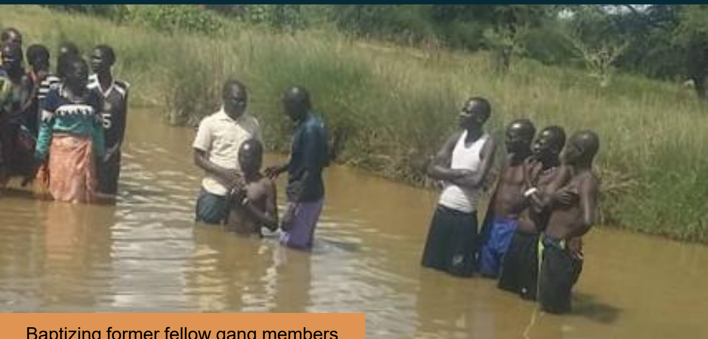
Baptizing former fellow gang members