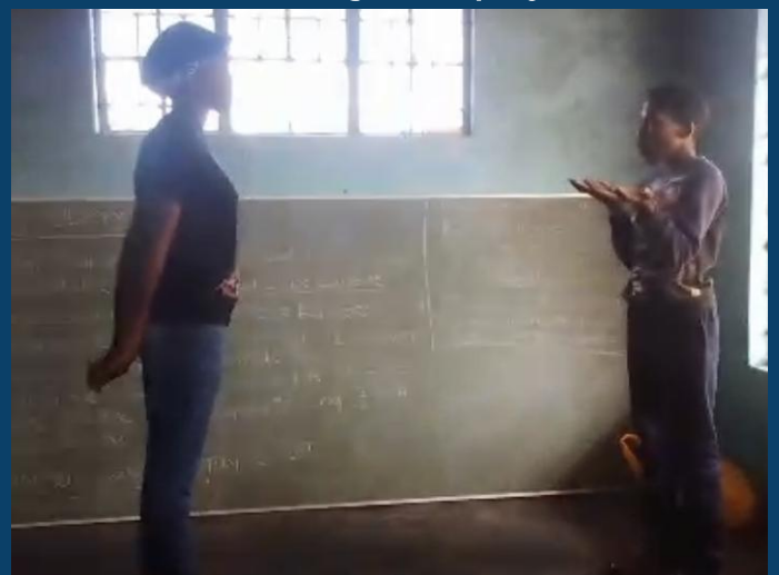
One of the children in her ministry doing the same.